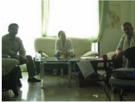
KUNCHOK GELEK AND SAILHAMO SAMANG BRIEF JO INGE BEKKVOLD 1ST SECRETARY, EMBASSY OF NORWAY, BEIJING

A REPRESENTATIVE FROM THE EMBASSY OF NORWAY VISITED TBF'S OFFICE IN CHENGDU TO MEET WITH TBF STAFF AND LEARN MORE ABOUT PROJECTS FUNDED BY NORWAY. THE REPRESENTATIVE WAS ALSO ABLE TO VISIT TBF PROJECT SITES IN DARTSEDO, GANZI PREFECTURE.