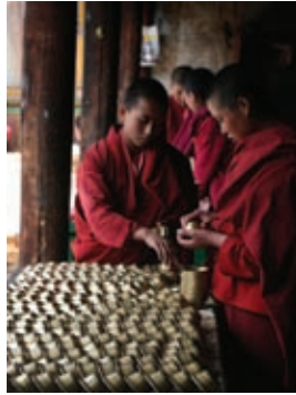
TIBETAN NUNS AT TABA LING NUNNERY. TBF HAS SUPPORTED THE RESTORATION OF THIS NUNNERY WITH CHINA EXPLORATION RESEARCH SOCIETY

TBF FOCUSES ON CULTURAL CENTERED DEVELOPMENT IN AN EFFORT TO SUPPORT PRESERVATION AND PROTECTION OF TIBETAN CULTURAL HERITAGE. TBF RESTORES AND PROTECTS SACRED SITES, PROTECTS ENDANGERED TEXTS AND TRADITIONS AND PROMOTES THE USE OF TIBETAN LANGUAGE