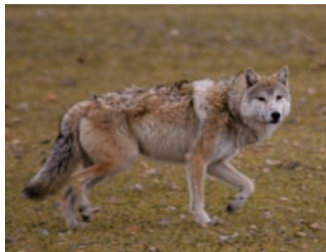
TIBETAN WOLF ON THE CHANGTANG

THE CHANGTHANG IS THE 2 ND LARGEST NATURE RESERVE IN THE WORLD TBF IS TRAINING A TOTAL OF 5429 NATURE GUARDS AND NOMADS IN THE CHANGTHANG TO PROTECT WILDLIFE INCLUDING SNOW LEOPARDS, WILD YAK, TIBETAN ANTELOPE, TIBETAN BROWN BEAR AND OTHER ENDANGERED SPECIES. EFFORTS ARE ALSO BEING MADE TO SUPPORT CONSERVATION AND PROTECTION OF WATER RESOURCES IN OTHER AREAS OF THE PLATEAU.