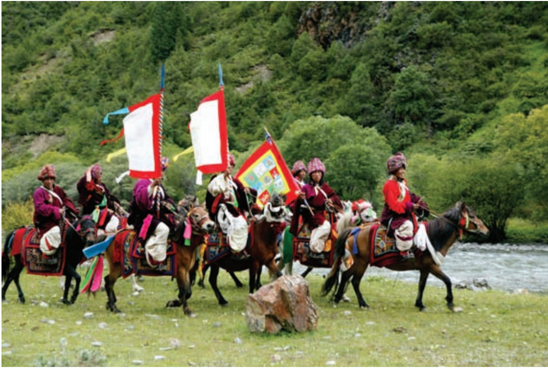
TIBETAN NOMAD CULTURE IN DZONGSAR

EVERY CONTRIBUTION IS TAX DEDUCTIBLE TO THE EXTENT ALLOWED BY LAW. PLEASE MAKE A DIFFERENCE FOR TIBETAN NOMADS AND MAKE A GIFT TODAY!