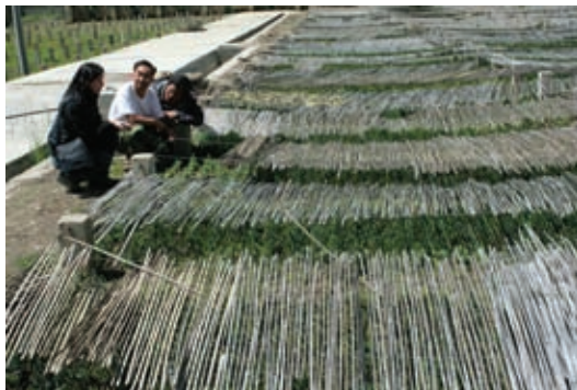
M. GARRY AND SONAM WONJAL VISIT TBF PROJECT SITE IN HORSHE

IN 2000 AND 2001 TBF SUPPORTED THE CONSTRUCTION OF A GREENHOUSE AND DEVELOPMENT OF SEEDLING BEDS FOR THE HORSHE NURSERY IN SERTHAR COUNTY IN RESPONSE TO REQUESTS FOR REFORESTATION SUPPORT. TBF CONDUCTED AN UNANNOUNCED SITE VISIT IN AUGUST TO SEE HOW THE PROJECT WAS DOING. WE WERE PLEASED TO NOTE THAT BOTH THE GREENHOUSE AND TWO LARGE SEEDLING BEDS FOR CONIFER TREES ARE FULLY FUNCTIONING AND WELL TENDED. THE GREENHOUSE MANAGER ESTIMATES THAT OVER 1,000,000 MILLION SEEDLINGS HAVE BEEN GROWN AT THE NURSERY AND PLANTED ON MOUNTAINSIDES IN SERTHAR COUNTY. TBF IS VERY PLEASED WE WERE ABLE TO MAKE THIS CONTRIBUTION TO IMPROVING THE ENVIRONMENT AND PREVENTING FURTHER EROSION IN THIS BEAUTIFUL COUNTY.