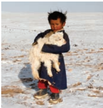
TIBETAN NOMAD CHILD IN CHANGTANG, NAGCHU

TBF WORKS WITH LOCAL COMMUNITIES TO SUPPORT THEIR DEVELOPMENT PRIORITIES AND NEEDS. THIS PROGRAM IS PARTICIPATORY AND DELIVERS MEANINGFUL RESULTS THROUGH TRAINING, COOPERATIVE DEVELOPMENT, COMPETITIVE SMALL GRANTS PROGRAMS AND THE USE OF APPROPRIATE TECHNOLOGIES.