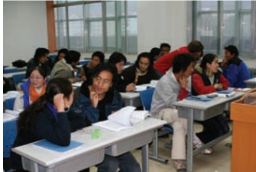
TIBETAN STUDENTS AT ENGLISH LANGUAGE TRAINING PROGRAM, XINING TBF SUPPORTS STUDENTS FROM ALL AREAS OF THE PLATEAU TO ATTEND THIS EXCELLENT 4 YEAR PROGRAM

EDUCATION NEEDS ARE CRITICAL IN NOMAD AREAS. OVER 50% OF TBF'S FUNDING SUPPORTS EDUCATION PROGRAMS FROM KINDERGARTEN TO UNIVERSITY AND TECHNICAL TRAINING